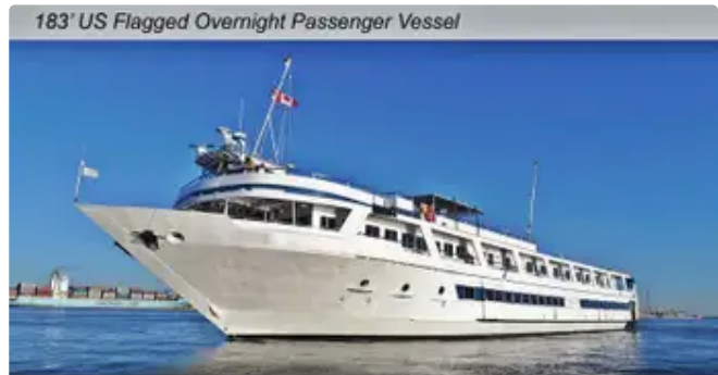
183' US Flagged Overnight Passenger Vessel